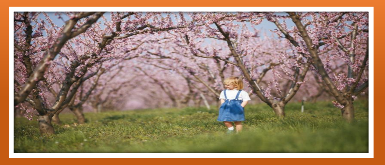
And said, Verily I say unto you, Except ye be converted, and become as little children,