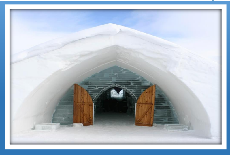
Behold, I stand at the door, and knock: if any man hear my voice, and open the door, I will come in to him, and will sup with him, and he with Me. – Revelation 3:20