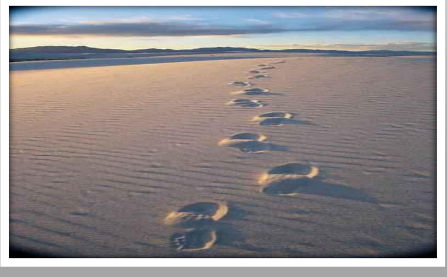
And He saith unto them, FOLLOW Me, and I will make you Fishers of Men. Matthew 4:19